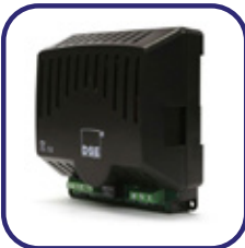
Automation kit for network failure operation.