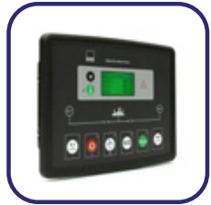
DSE 334 network surveillance