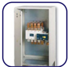
Socomec motorised switchboard