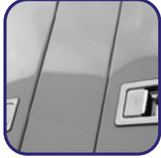
Complete stainless steel canopy (304)